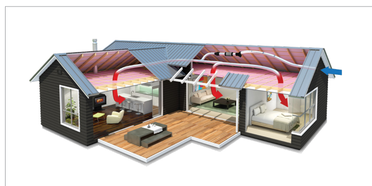
DVS® Premium Connect in Summer Ventilation Mode